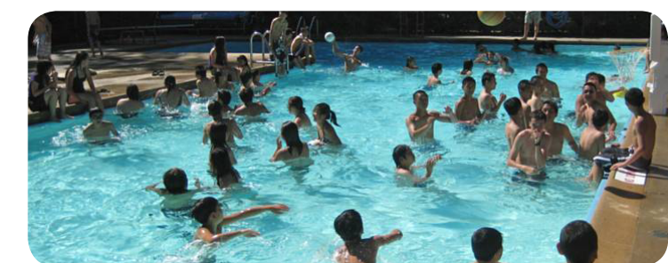
Enjoying the pool at West.