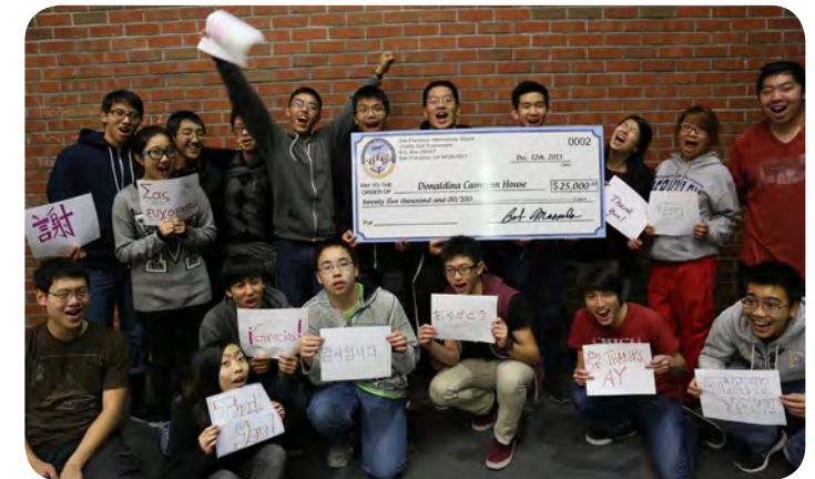
Thank you for the $25,000!