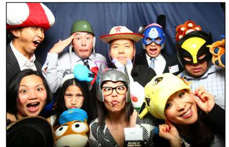
...followed closely by the EPIC Commission