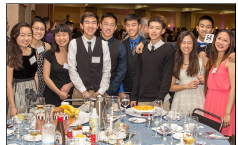
Dessert Dash – Youth enjoying their sweet claim