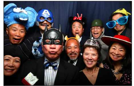
The Angelettes and Cobras having a great time...

Donaldina Cameron's fierce compassion continues to serve as inspiration for us to help each individual who comes through our doors, and to be a welcome and safe community for all. Happy 120th Anniversary, Donaldina!