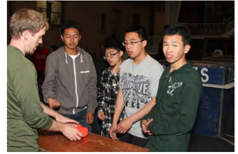
9:30pm Friday, May 4th: Final preparations for Carnival concessions at Main yard.