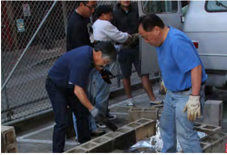
5pm Friday, May 4th: BBQ Pit Volunteers setup to make over 400 meals.