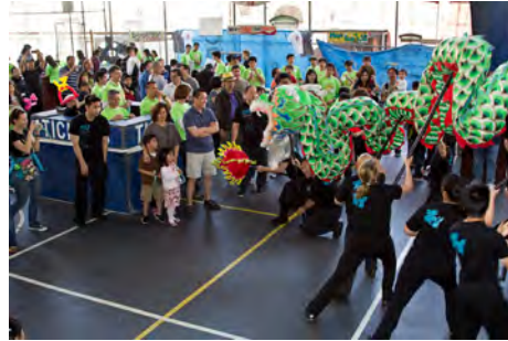
3pm Sat., May 5th: Kei Lun Martial Arts performs a traditional Dragon Dance.