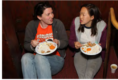
7:30pm Friday, May 4th: Pre-Carnival rally and dinner for Carnival volunteers and helpers.