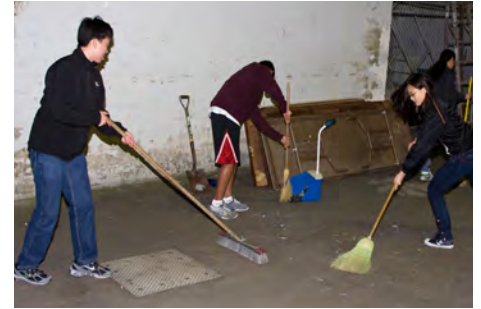
8:30pm Sat., May 5th: Faithful volunteers cheerfully help cleanup and close Carnival, see you again on Sat. May 4th, 2013!