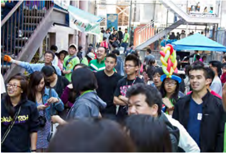
Noon Sat., May 5th: Carnival in full swing