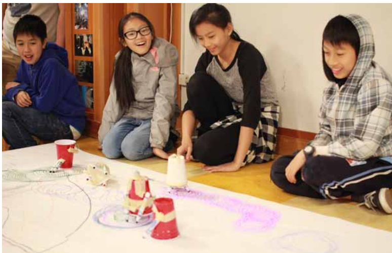
This year, the BAP Spring Break program will focus on tinkering and will include trips to the Exploratorium, San Jose Tech Museum, and the San Francisco Main Library (for a tinkering with legos activity).