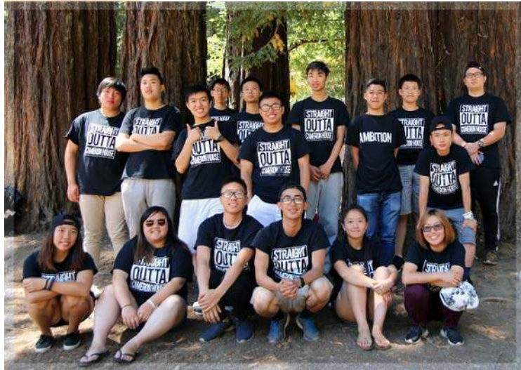
BASIC participants at West

Other logistics and planning were with our youth in the BASIC program, because there were two main activities that they had to plan for the main camp. Getting them to learn to make time during the week to plan for these