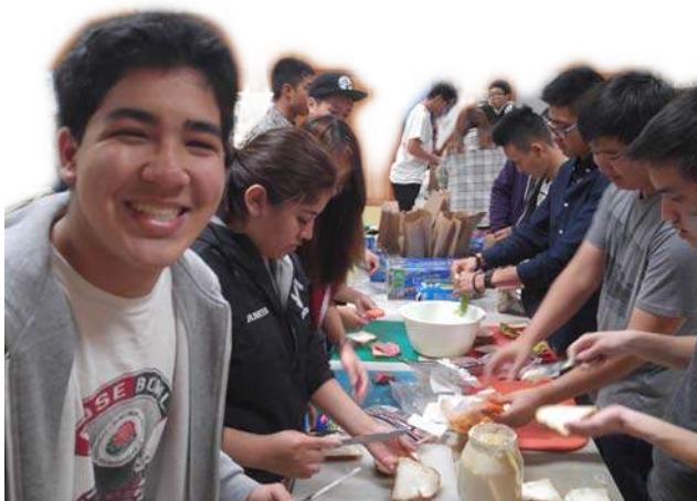
Members of AMBITION, CHANCE, and ORIFLAMME preparing sandwiches for Light the Night