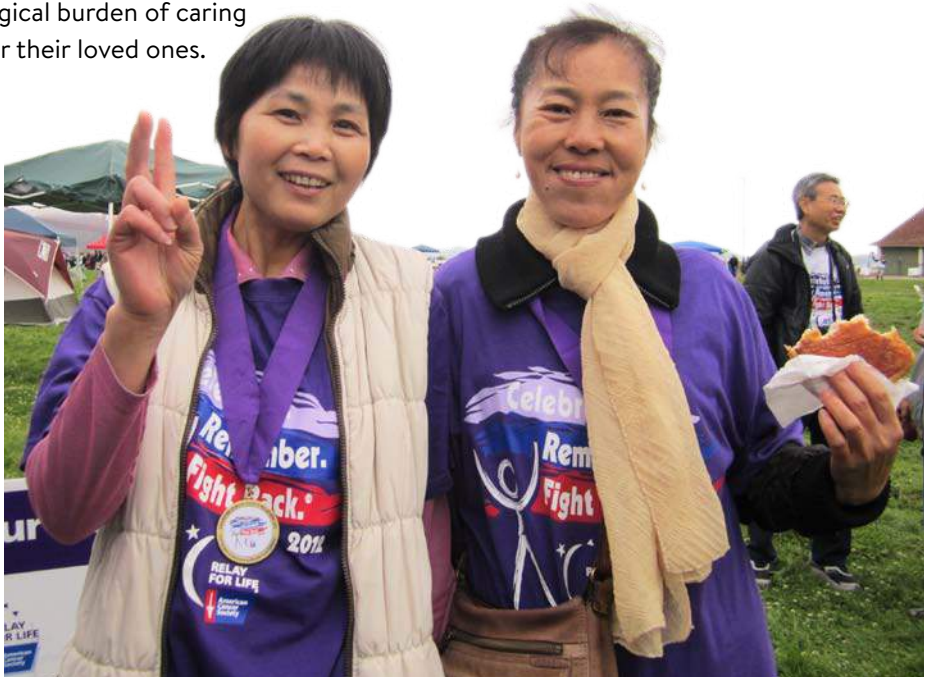
Two members of our Cancer Support Group helping each other on their journey!