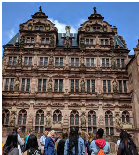
The group visits the Friedrichsbau, built 1601-1607 and part of the iconic Heidelberg Castle.