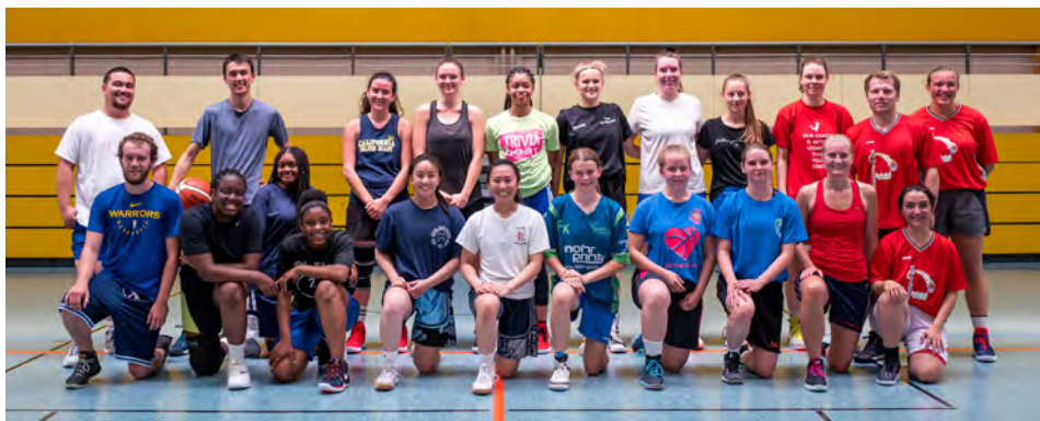
A court-side group photo of the trip participants from Booker T. Washington Community Service Center, Cameron House, and a local Heidelberg team.

The primary component of the trip was basketball. Despite having cultural and linguistic barriers, all the participants shared a common passion for the sport and could communicate seamlessly during practices, games, and an informal tournament at the end of the trip. In addition to basketball, the program included sightseeing in one of the oldest and most well-preserved cities in Germany. Heidelberg is home to Germany's oldest university and much of the city's historic buildings were left untouched during World War II.