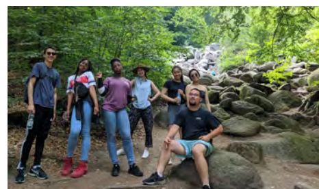
Felsenmeer rock formation in the Odenwald mountain range.

In our increasingly global world, learning to understand other cultures and build personal relationships across personal differences is more important than ever. Moreover, the trip was an opportunity for personal growth.