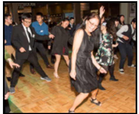
Captions on bottom of page 2