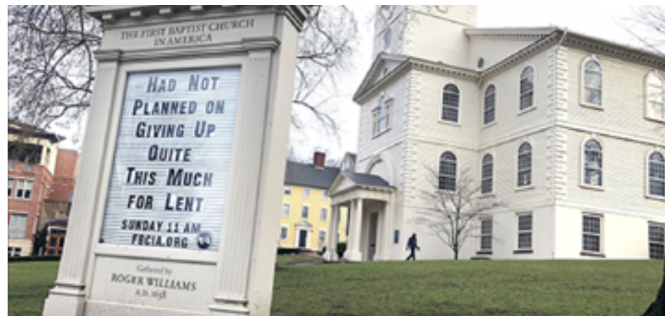
First Baptist Church in America in Providence, R.I. on March 24, 2020